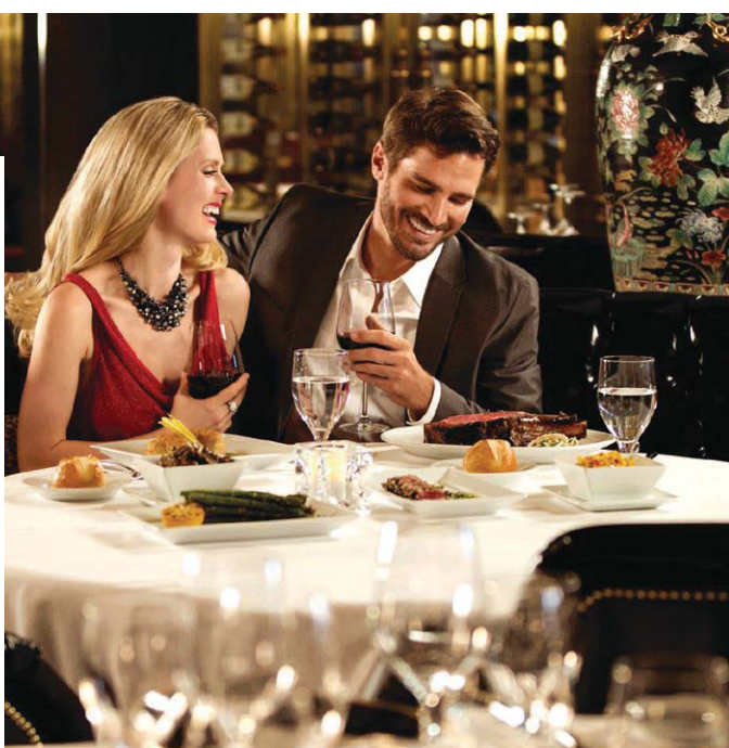
The Prime Rib, Maryland Live! Casino