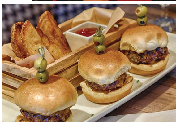
Fuel American Grill, Hard Rock Sioux City