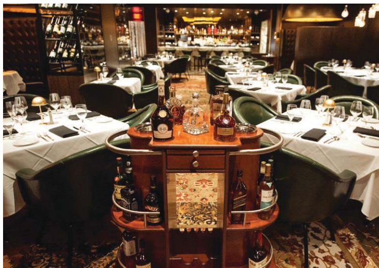
Andiamo Steakhouse, The D Las Vegas