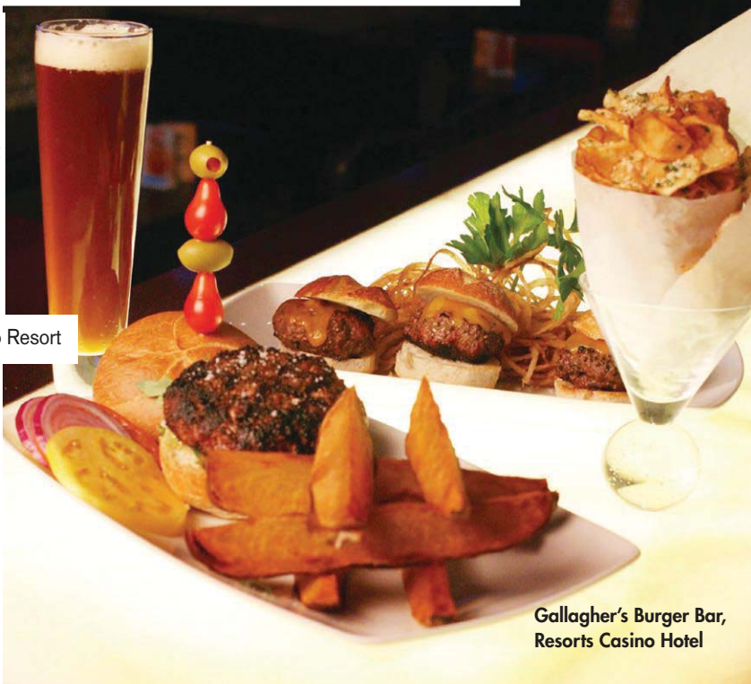
Gallagher's Burger Bar, Resorts Casino Hotel